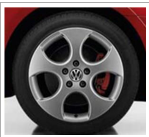
17" Denver Alloy