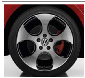
18" Detroit Alloy