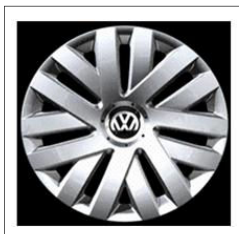
16" Steel Wheel w/