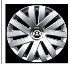
16" Steel Wheel w/ Cover